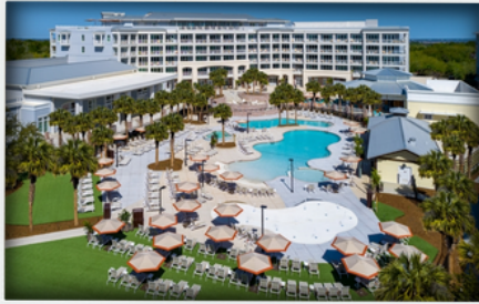
Wild Dunes Resort

Wild Dunes Resort 5757 Palm Blvd Isle of Palms, SC 29451 June 8- 12, 2023